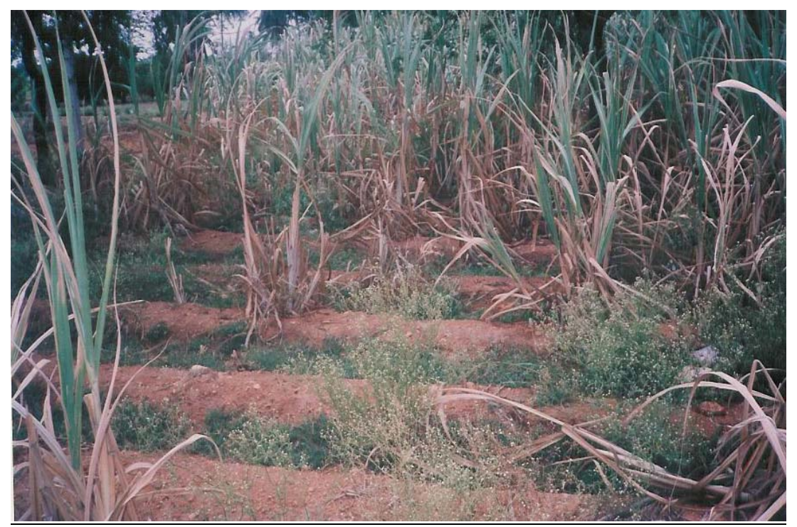
Fig 8: Sugarcane crop stand affected by distillery pollution affected water, Nanjangud, Mysore <u>district, 2002-3.</u>