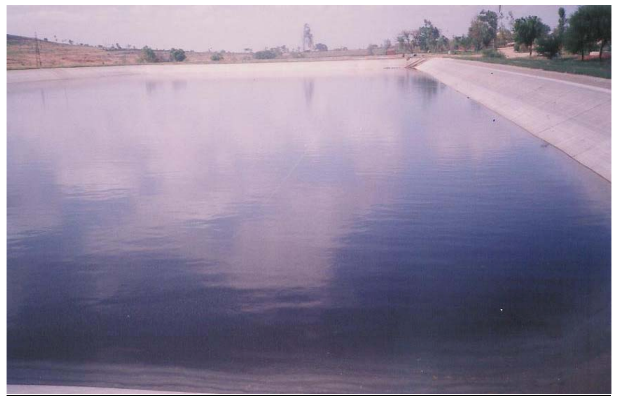
Fig 5: Spent wash from distillery effluents stored in lagoons, polluting groundwater extensively, Nanjangud, Mysore district, 2002-3