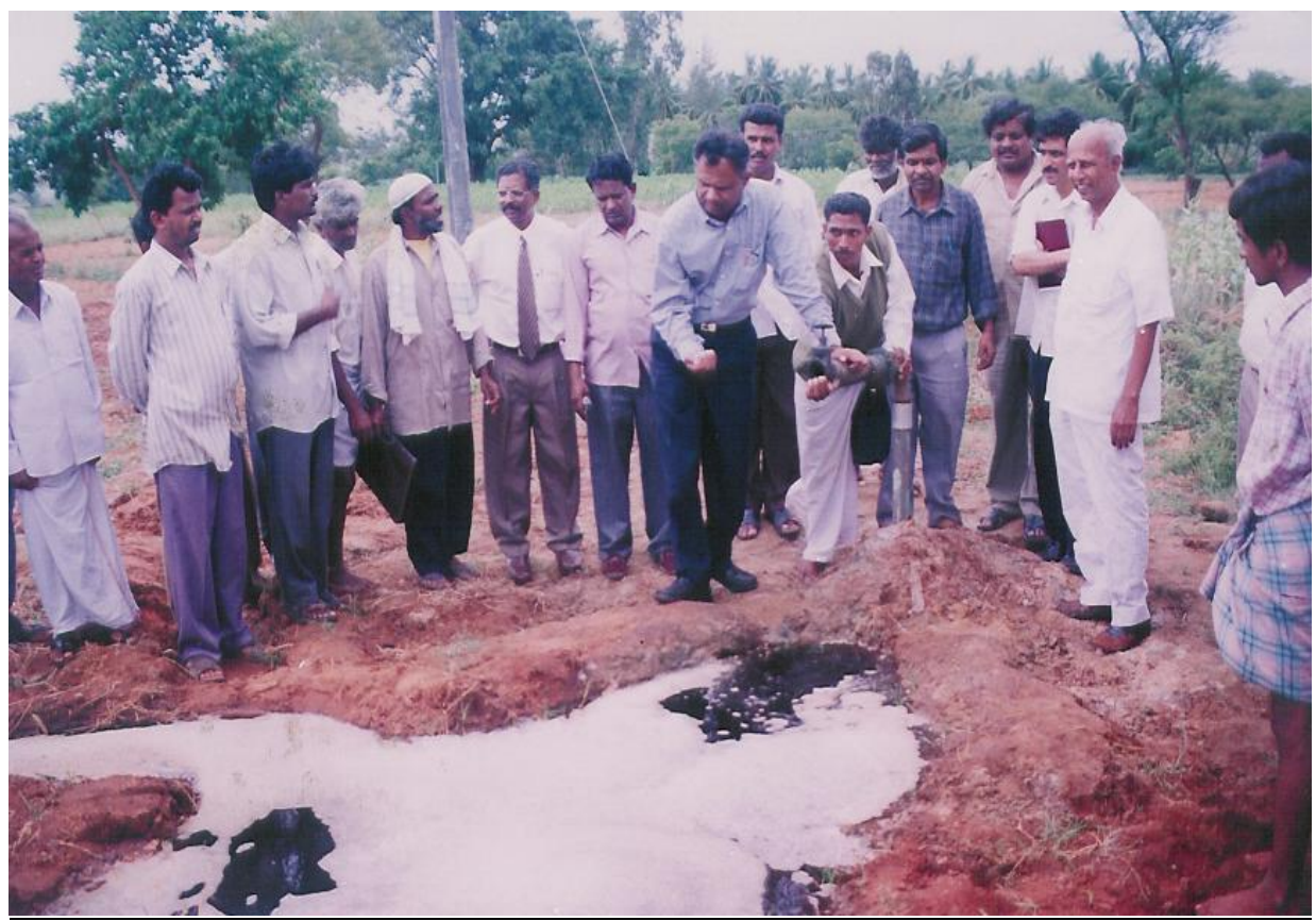
Fig 6: Lokayuktha officials watching the distillery effluent polluted water pumped out by a farmer, Nanjangud, Mysore district, 2002-3