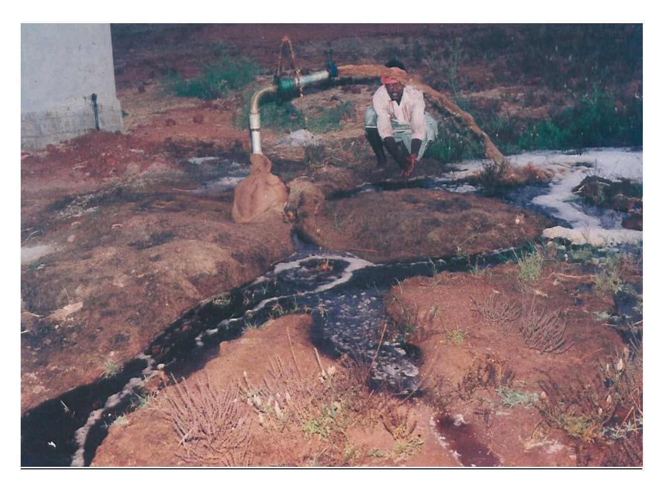
Fig 1: Distillery pollutant affected groundwater from borewell in Nanjangud, Mysore district, Karnataka, 2002-3