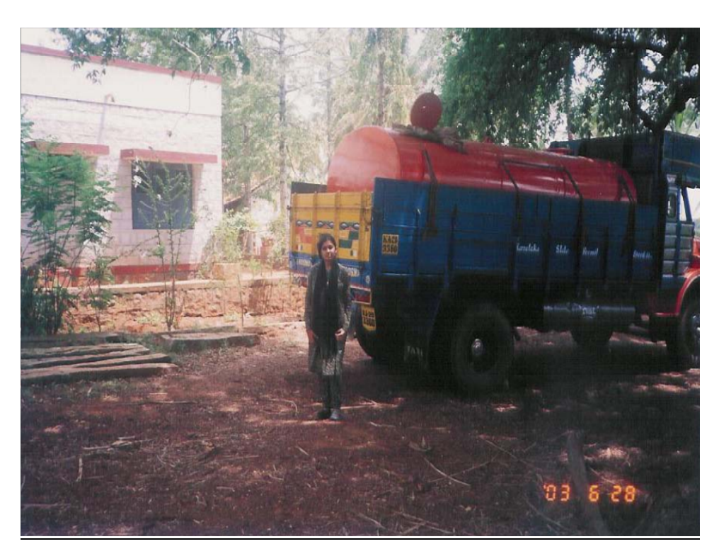
Fig 9: Spent wash being transported by distillery to free delivery to distant farms convincing the farmers that the spent wash is rich in nutrients in 2002-3