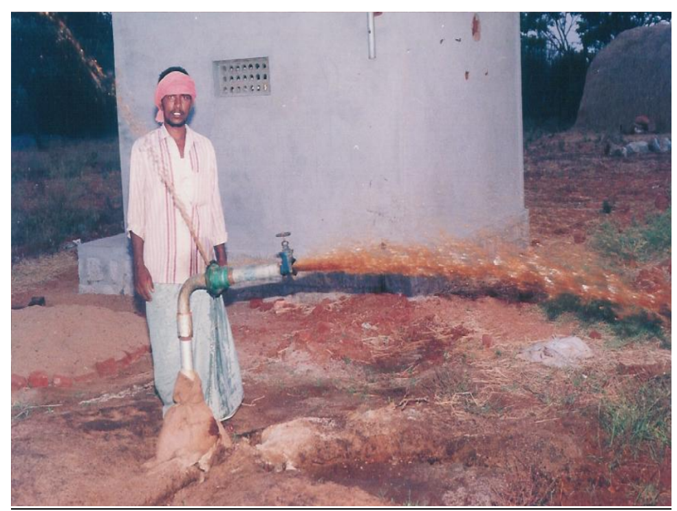
Fig 10: Distillery effluent polluted groundwater pumped out of the borewell in Nanjangud, Mysore district, 2002-3