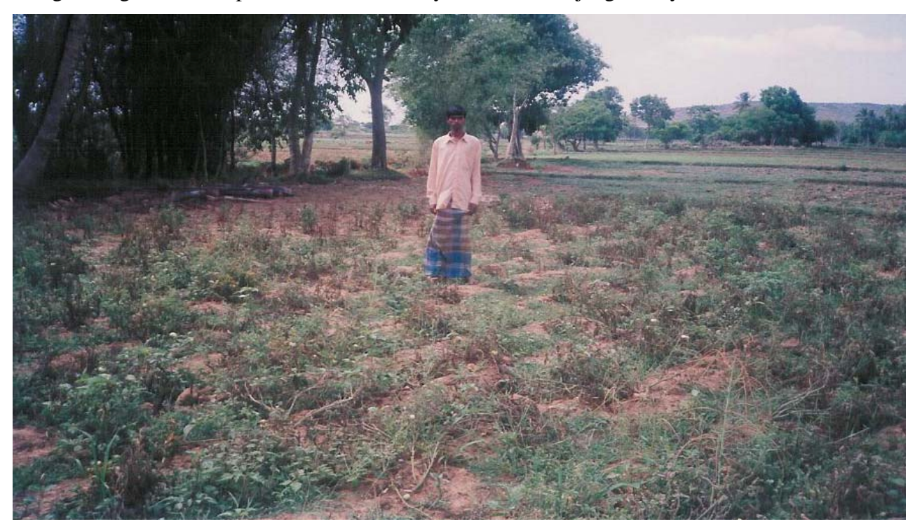
<u>Fig 3: Wilted plants – crop damage due to use of distillery effluent groundwater for irrigation,</u> <u>Nanjangud, Mysore district, 2002-3</u>