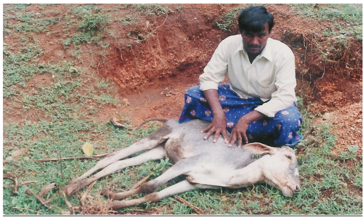
Fig 7: Farmer with his dead calf, due to frequent consumption of distillery effluent polluted water, Nanjangud, Mysore district, 2002-3